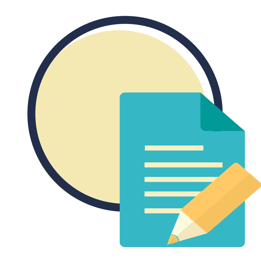
Step 2: Write an essay (no more than 500 words) describing how your background and experiences have led you to appreciate the difficulties faced by the medically underserved.